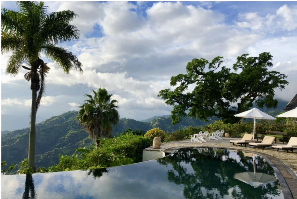
The infinity pool at Strawberry Hill.

We sent the chilliest guy we know (and his video camera) to Strawberry Hill in Jamaica's Blue Mountains. He's still feeling the high.