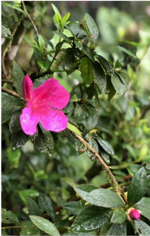
A misty hike in the Blue Mountains.

What's more impressive: I drank the best damn cup of coffee of my life somewhere 4,000 feet up in the mountains at the family-run Old Tavern Coffee Estate. I'd travel pretty much anywhere for a cup of joe like that.