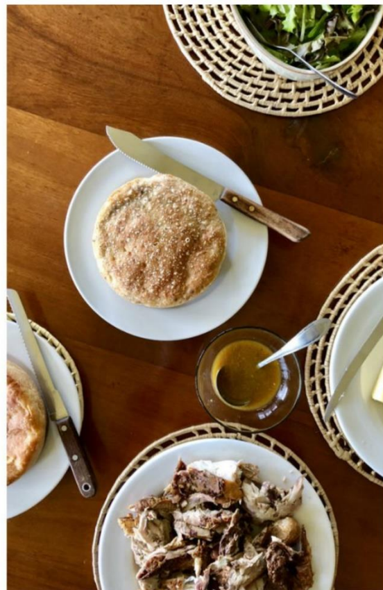
At the bar. Jamaican lunch.