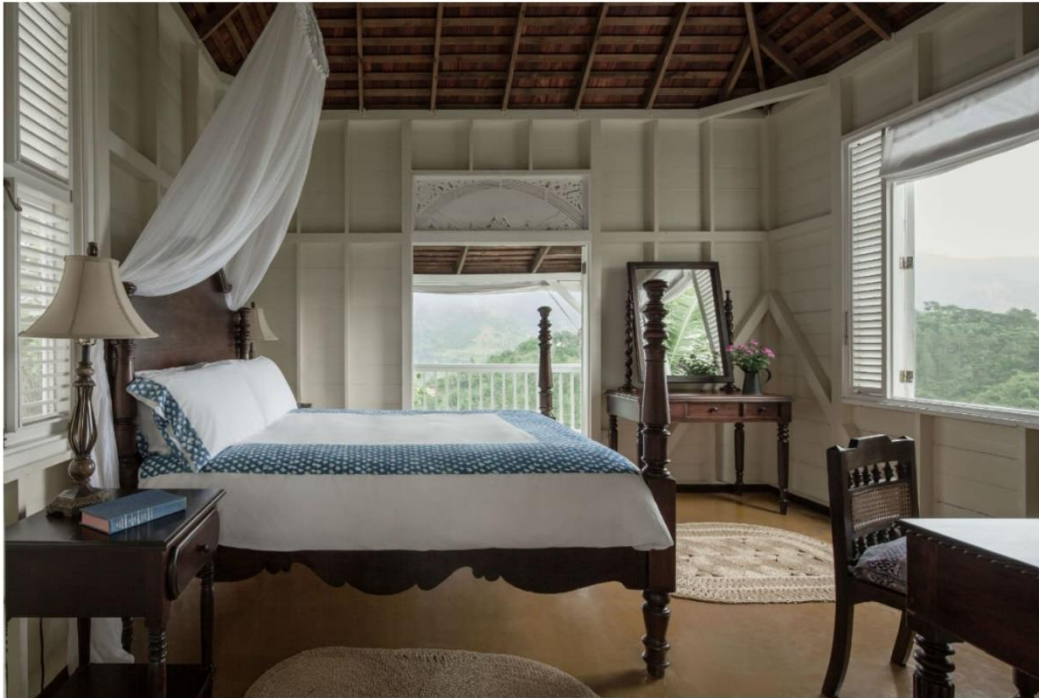
Breezy cottage room. The veranda. Mountain views.

A vacation here is a vacation from the Jamaica you think you know. Instead of frozen cocktails on the beach, you're in for insane poolside views, lush hikes, cool breezes, and misty midnight air. There are hundreds of species of flowers, trees, and birds, only interrupted by coconut stands and cool roadside jerk shacks that cling to the mountainside.