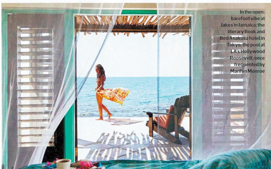
In the open: barefoot vibe at Jakes in Jamaica; the literary Book and Bed Asakusa hotel in Tokyo; the pool at LA's Hollywood Roosevelt, once frequented by Marilyn Monroe