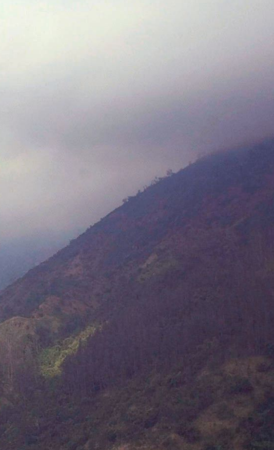
Clockwise from left: Clouds are formed directly over the peaks, giving the mountains their famous blue hue; each of the secluded cottages offers spectacular views; the pool just after sunset; the four-poster beds are as comfortable as they are inviting.